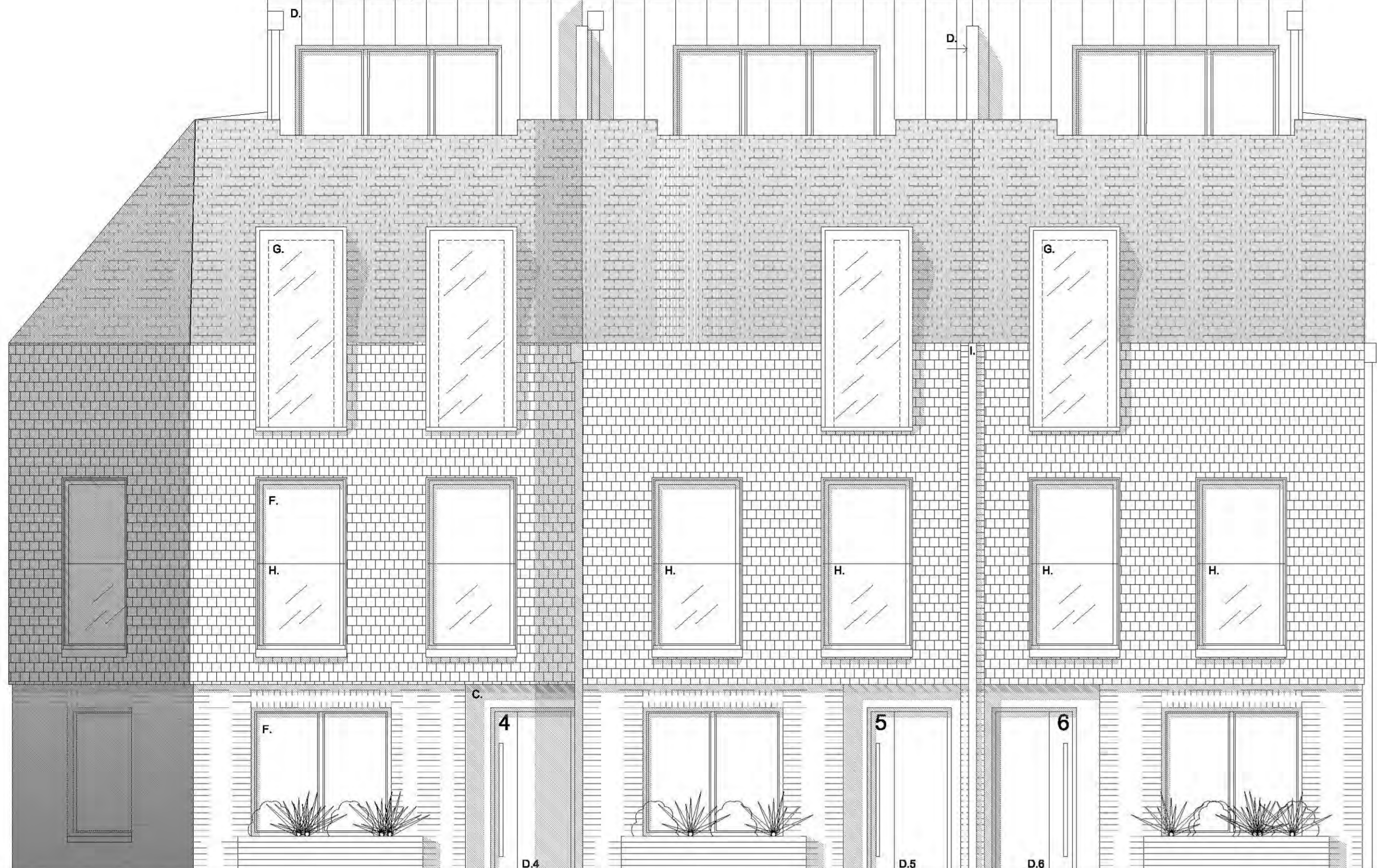
H4 FRONT ELEVATION