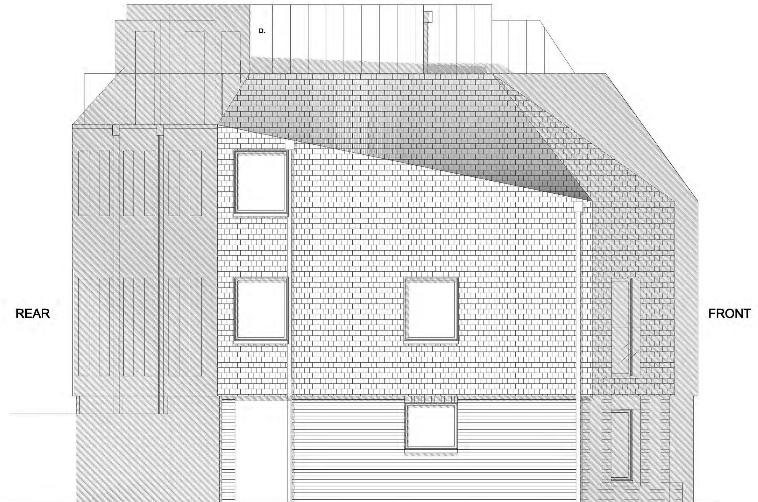
H4 SIDE ELEVATION