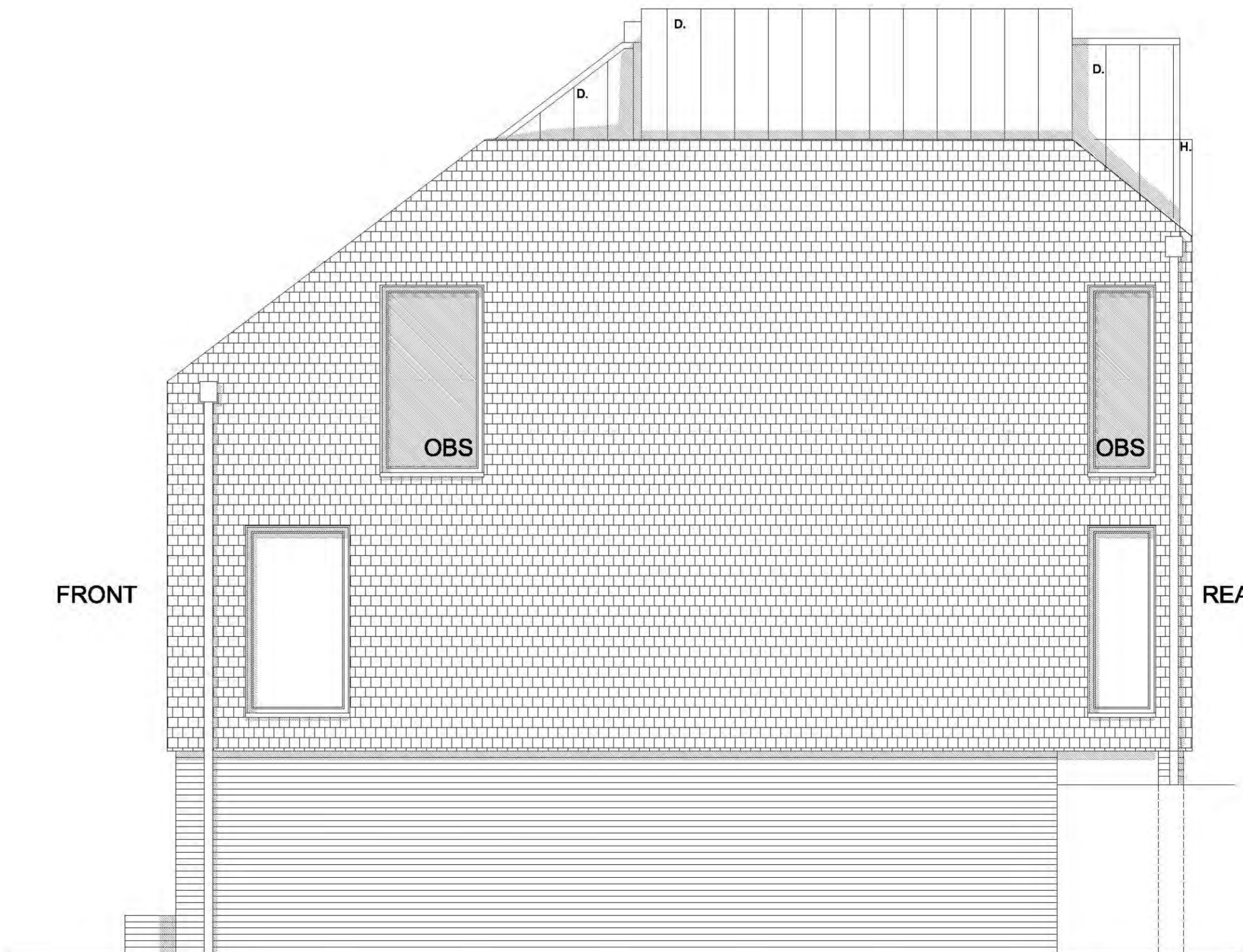
H6 SIDE ELEVATION

EXTERNAL MATERIALS KEY: A. CLAY TILE MIX: MARLEY ETERNIT STAFFORDSHIRE MIXTURE-RED,BROWN,BLUE B. BLUE BRICK, IBSTOCK ATLAS SMOOTH BLUE C. DARK GREY RENDER D. STANDING SEAM ZINC CLADDING, COLOUR: LIGHT GREY, AZENGA BY VMZINC E. BLUE BRICK F. WINDOWS&DOORS, FRAMES PAINTED: SIGNAL BLACK RAL 9004 G. CLEAR GLASS FRAMELESS DORMER WINDOW H. CLEAR GLASS BALUSTRADE I. RAINWATER GOODS, PAINTED BLACK D.4 DOOR COLOURS: SIGNAL BLACK RAL 9004, RAL 5009 BLUE D.5 DOOR COLOURS: SIGNAL BLACK RAL 9004, RAL 5001 BLUE D.6 DOOR COLOURS: SIGNAL BLACK RAL 9004, RAL 5003 BLUE OBS OBSCURE GLAZING